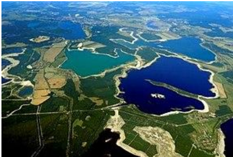
Figure 2: Section of the chain of lakes

Changes in industrial production allow tourists to understand the current changes in the landscape of the old-industrial regions as well as in regional and urban development.