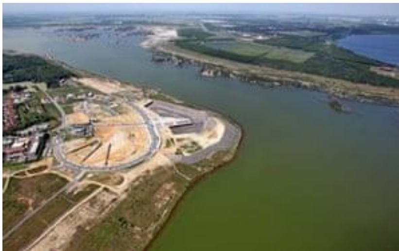
Figure 3: An aerial view of Zwenkaulake in Zwenkau, Germany. Flooding old mines have created huge network of lakes in Lusatia.